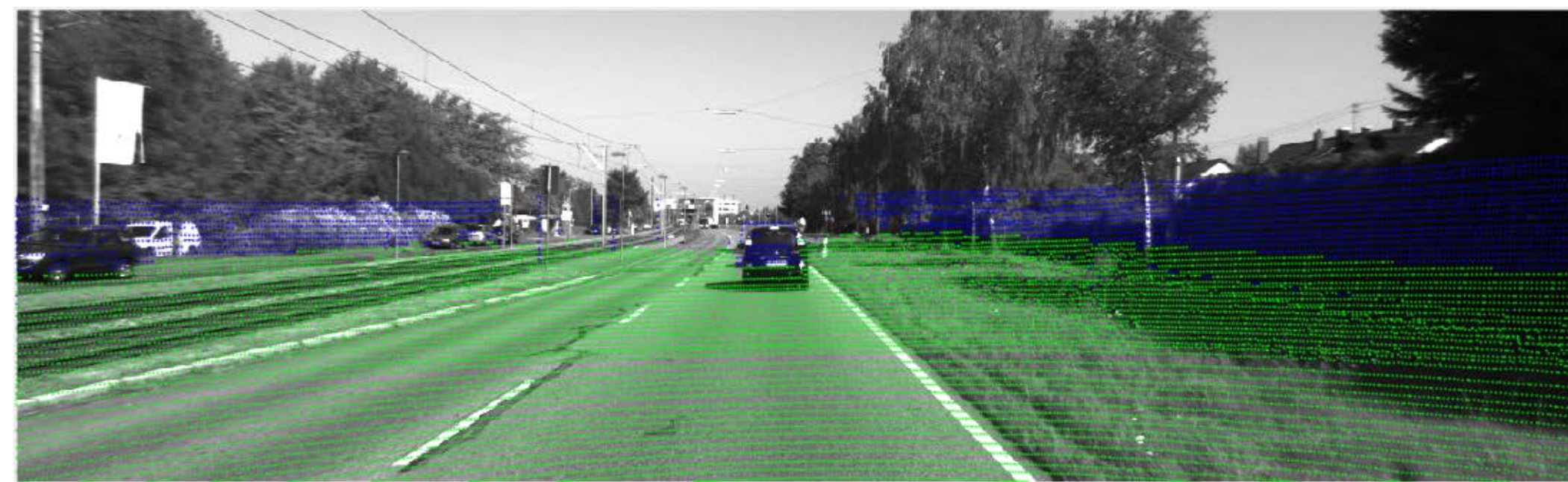
*Image is generated from KITTI data set

Vehicle perception system provides "vision" to the autonomous driving vehicle. The reliability and robustness of this system are crucial to the future of safe autonomous driving.